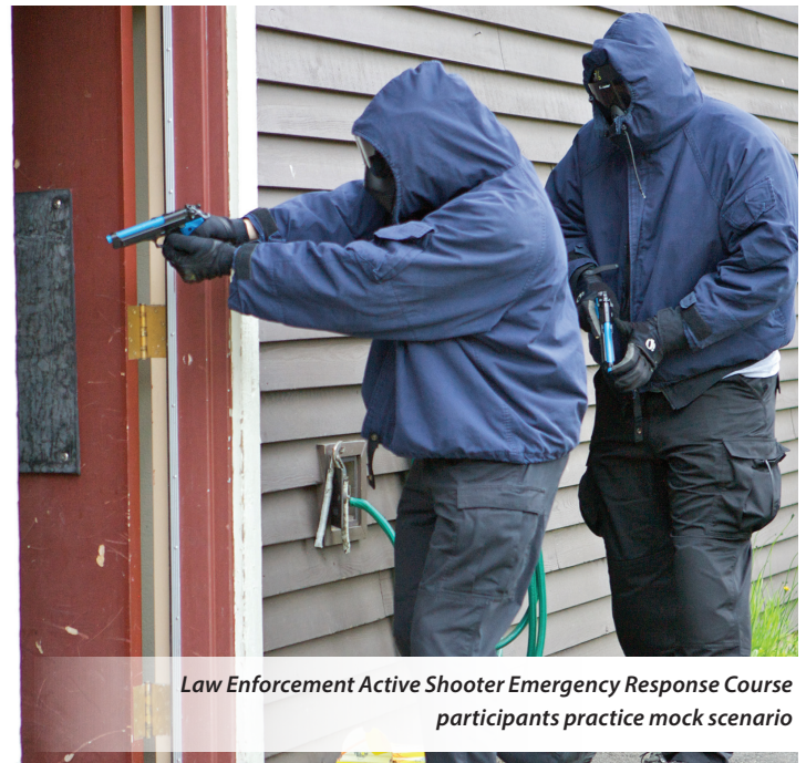
Law Enforcement Active Shooter Emergency Response Course participants practice mock scenario

NCBRT delivering timely mobile training tailored to meet the needs of communities across the nation