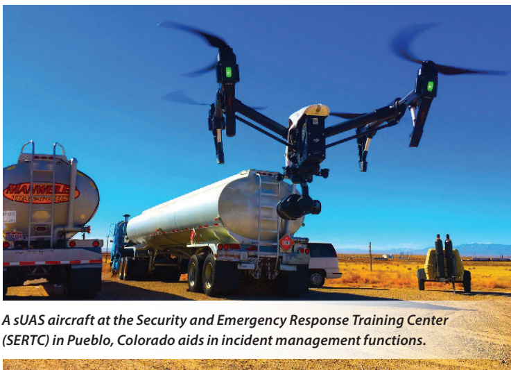
A sUAS aircraft at the Security and Emergency Response Training Center (SERTC) in Pueblo, Colorado aids in incident management functions.

The term Culture is sometimes defined as the cumulative deposit of knowledge, experience and attitudes. The term “Preparedness” is closely related to the FEMA policy and doctrine of Prevent, Protect, Respond and Recover, especially in the Prevent and Protect categories. The concept of “readiness to act” also applies.