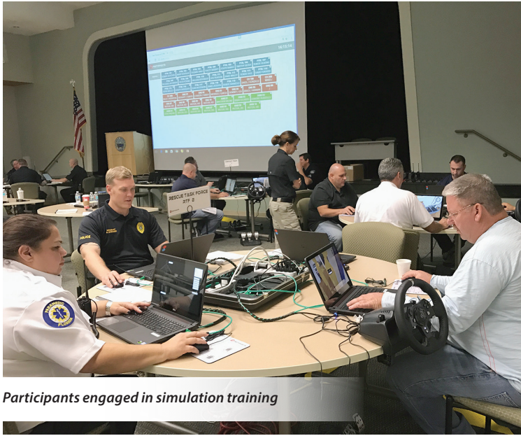
Participants engaged in simulation training

Exercises in integrated staging, tactical management, triage, transport and operations prepare participants