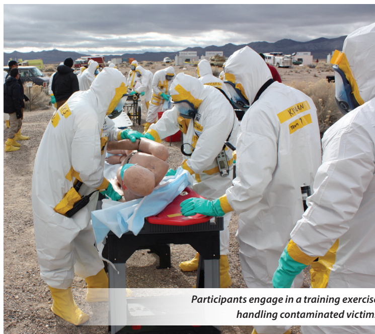
Participants engage in a training exercise handling contaminated victims

This course is a recertification of the existing WMD Radiological/Nuclear Responder Operations Course (PER-240), which has been delivered for a number of years as a mobile training course. By moving the course to the Nevada National Security Site (NNSS), the training is able to take advantage of the unique access to radiological areas, which will enhance the training experience for the participants. ■