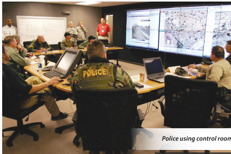
Police using control room

Community resilience and ability to recover in the aftermath of critical events is heavily dependent upon the degree of proactive planning and training the community has previously undertaken. Adequate preparation can minimize disruption and accelerate recovery time. Time and again, dissatisfaction and outrage by community members in the aftermath of a disaster can be directly traced to a lack of adequate preparation by first responders, emergency planners, and other officials. Those communities that rapidly recover from disasters and critical events most often have a demonstrated preparedness regimen that takes serious account of training, prevention, protection, mitigation, and response.